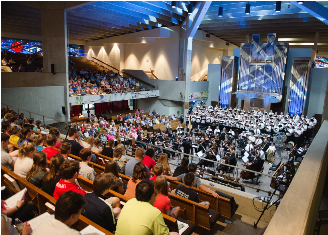
Worship conference opening concert, high school honor choir in foreground. Additional photos are included at the end of this report.

With over 1000 attendees, the national worship conference is the largest worship conference among North American Lutheran church bodies (including events sponsored by the pan-Lutheran Association of Lutheran Church Musicians), even though WELS is one of the smaller Lutheran synods. The 2017 triennial conference, with strong emphasis on the 500 th anniversary of the Reformation, was June 13-16, at Carthage College, Kenosha, Wis.